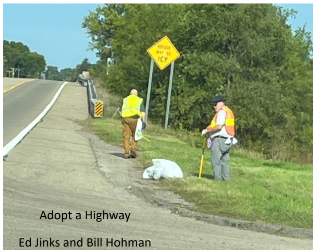
Adopt a Highway