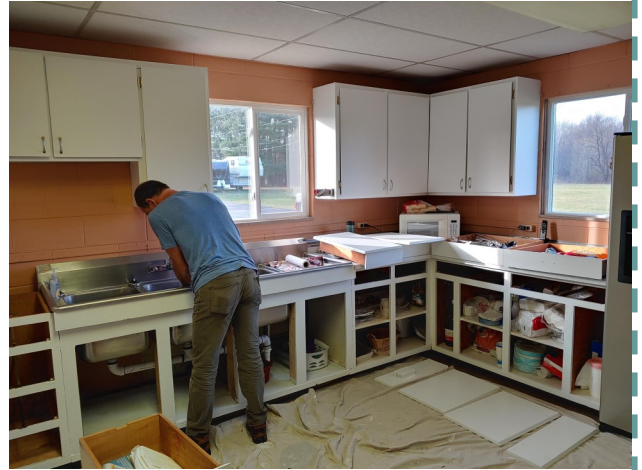
A worker cleans up after a long day of painting